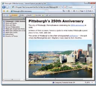
NetHelp for the Web