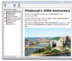
Online Help for Applications